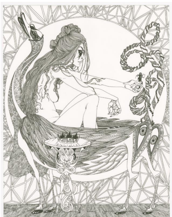
Bonne de Berry, stylo à encre permanente, 28x35.6 cm, Riex, avril 2022, Collection de © Caroline Tschumi